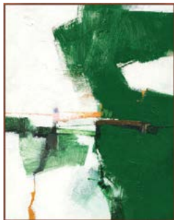
Wendover Art Group