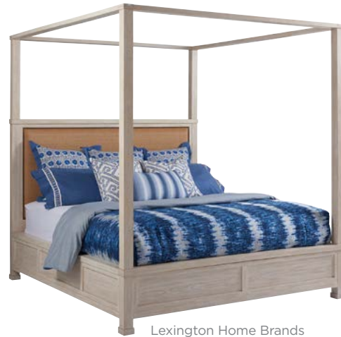
Lexington Home Brands