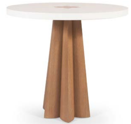
Maggie Cruz Home for Design Legacy

If your table has tapered legs, it is out. If it looks like a work of art carefully created by craftsmen, your table is au courant! Tables are now mere tops for incredible art forms. Geometric shapes, angular scissor-like structures, and anything ribbed is showing up on tiny cocktail tables, accent tables, and dining tables. The table is exciting again, and especially the dining table!