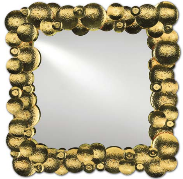
Currey & Company