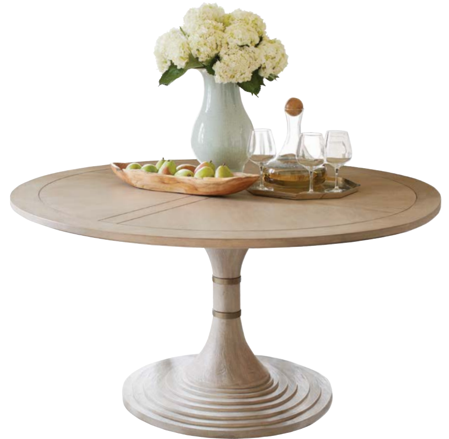
Lexington Home Brands