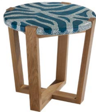
Ngala Trading Co.